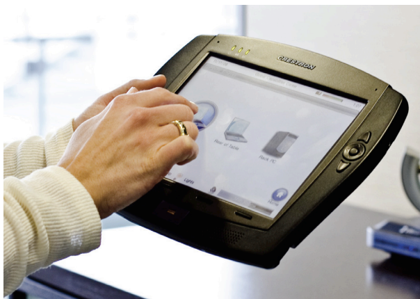
Crestron handheld devices are used to control audio and video equipment.