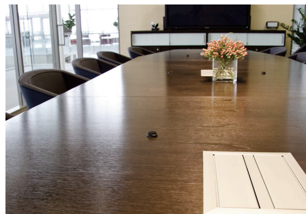
One Haworth Center's conference rooms have full technical capabilities, including ceiling or in-table microphones, audio/video conferencing and data power access in the table.

One Fact — One Haworth Center was awarded the 2008 Best Corporate Project Award from Pro AV magazine.