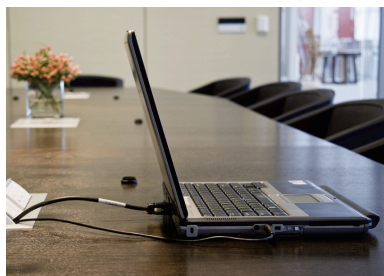
In conference rooms, members can seamlessly hook up their laptops to the system to give presentations on the plasma screens.

Some of the sustainability initiatives at One Haworth Center affect our members' well-being as well as the environment. For example, centralized print rooms require significantly fewer printers and have reduced paper consumption by more than 400,000 sheets in just six months. Even better, they ensure that emissions are contained — not released directly into work areas. A comprehensive wireless network lets members work wherever they're most comfortable. And fully equipped conferencing facilities mean our members don't have to carry their own technology from room to room.